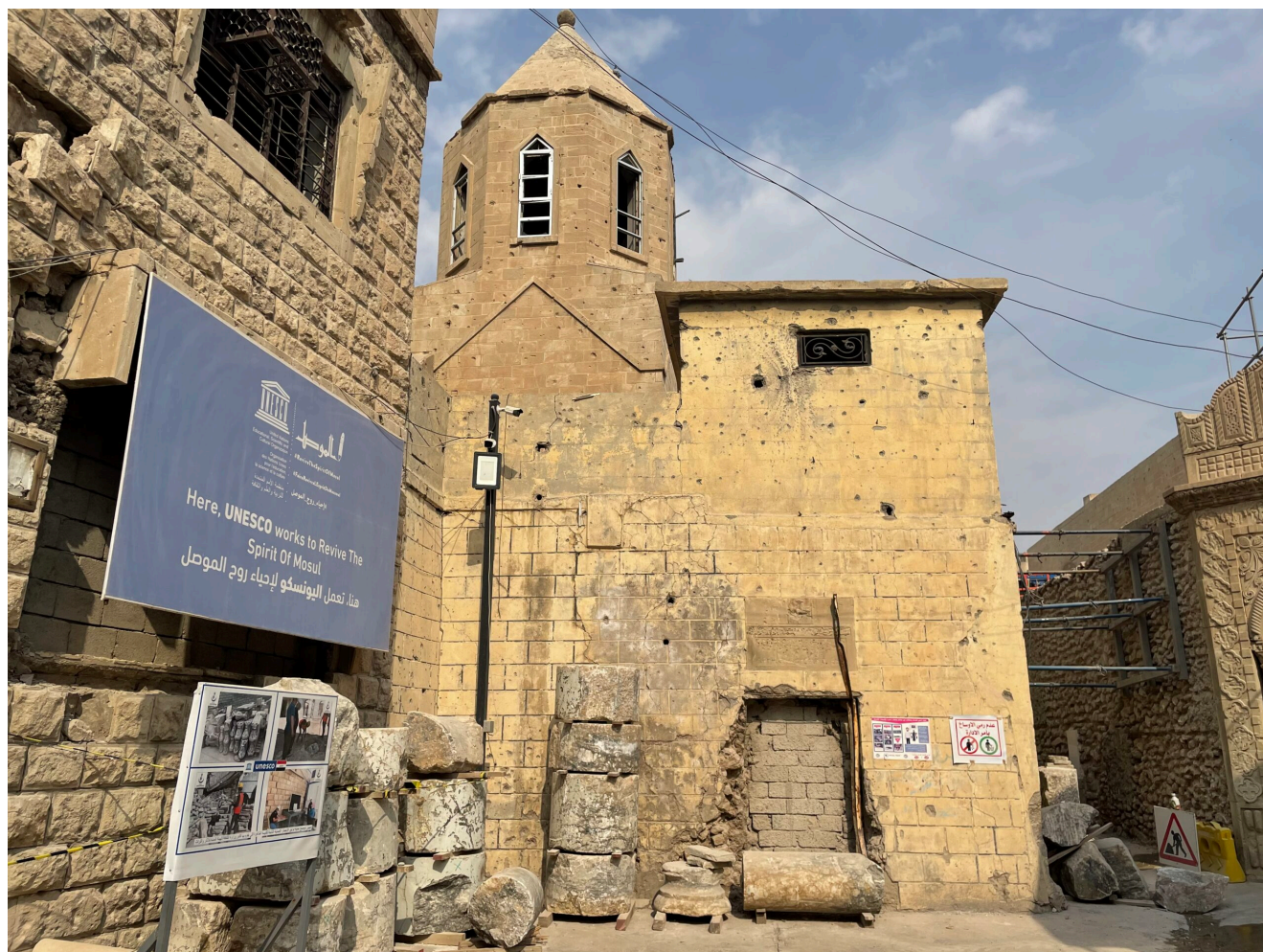
M o s u l c h u r c h , U N E S C O p r o j e c